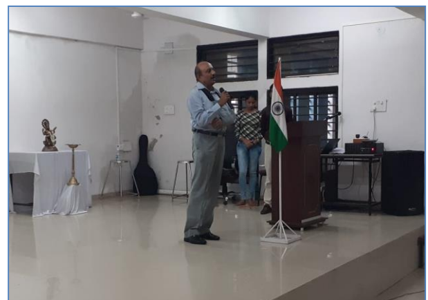
Welcome speech by Principal sir