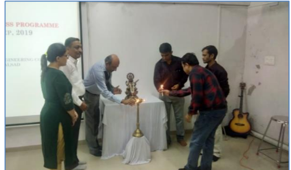
Lamp lightning at inaugural