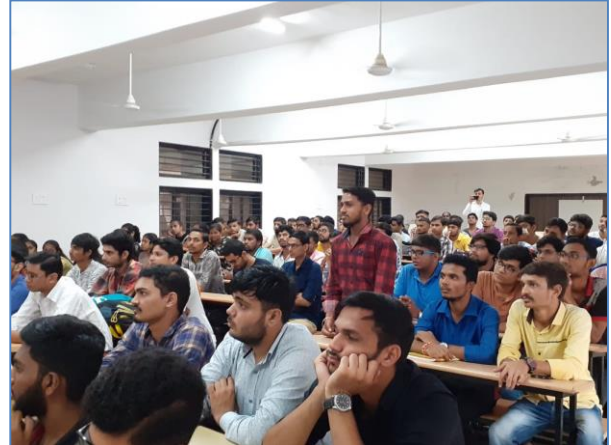
Students in Audience