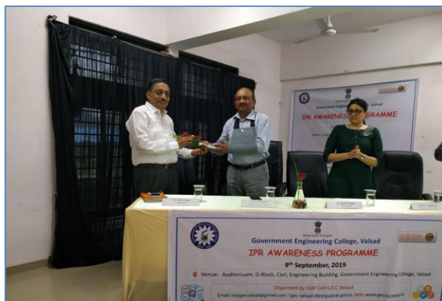
Felicitation of guests